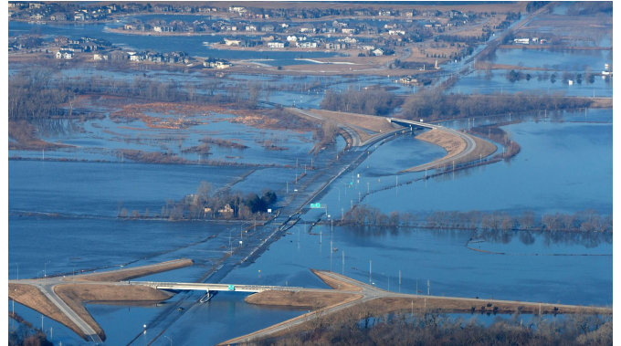
The flooding in Nebraska

It's predicted that the southern Nebraska stretch of the Missouri will most likely hit flood stage at some point this spring or early summer. The flooding will not be as bad as last year and this year the ground should not be frozen. If there is 1 to 3 inches of rain, it doesn't seem like a lot, but when the ground is frozen it can't absorb the water and the rivers are full. Therefore, this spring should not see flooding as bad as last year, but it could still cause problems in parts of Nebraska.