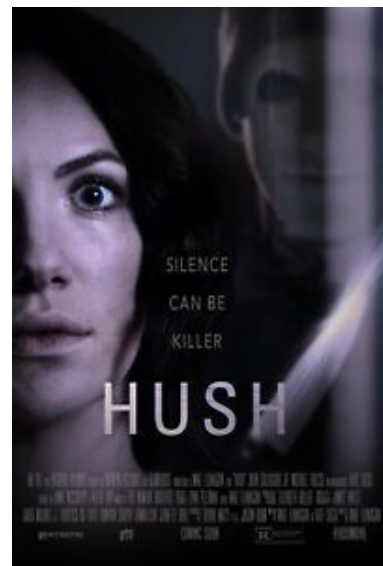
The official movie poster

Hush follows our main character, Madison "Maddie" Young, a deaf, mute writer who lives in a secluded home with only her cat. Her night turns into the worst of her life, when a stranger breaks into her home. Once he learns of her disability, she realizes there's only one way to survive: kill the man.